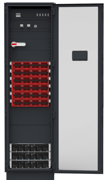
50 kW all-in-one power system

This mature technology (Ni-MH was already used in the automotive industry 20-year-Toyota Prius) also environment-friendly and fully recyclable as it does not contain heavy metals (RoHS compliant product).